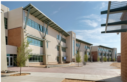
V. Sue Cleveland High School; a 416,000 square foot facility.